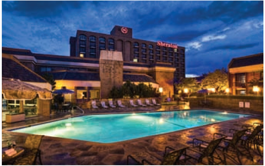
Sheraton, Salt Lake City, Utah, location of the VCFSEF 17th Annual International Scientific Meeting. July 16-18, 2010